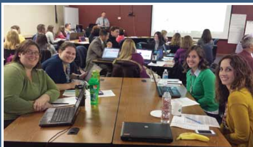
Bellefonte Area High School teachers pose for a picture while at a training at Central Intermediate Unit (IU10).