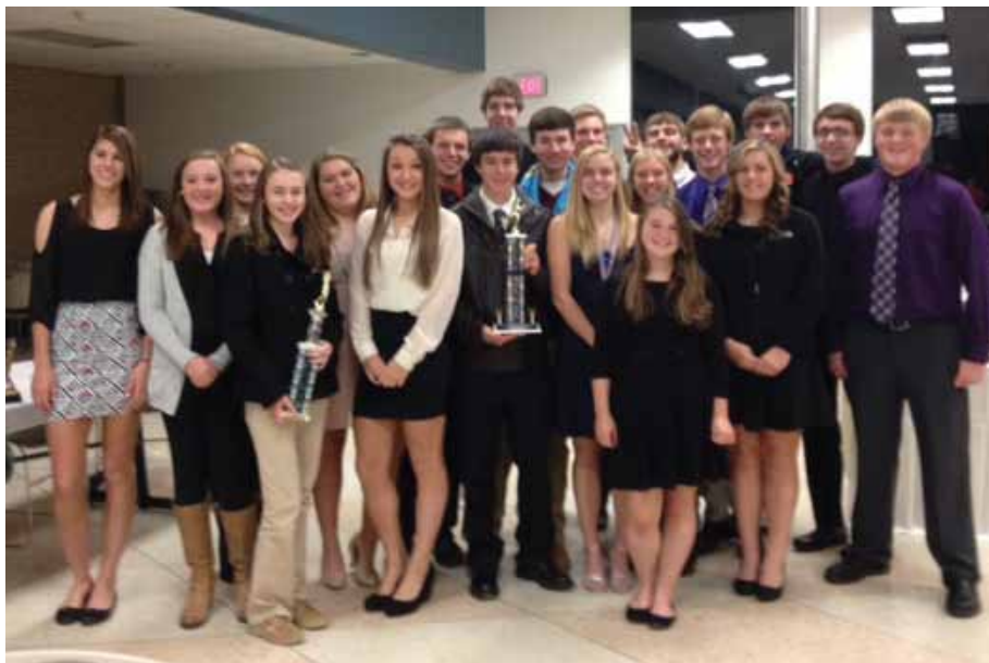
Bellefonte student athletes capture the Mountain League Fall Summit Award. The Summit Award is given to the Mountain League School with the highest winning percentage of all sports. Bellefonte's winning percentage was .582. This is the second year in a row Bellefonte has won this award.

If you would like to purchase a ticket, please contact any of the board members by using the following web address: http://www.basd.net/Page/64 .